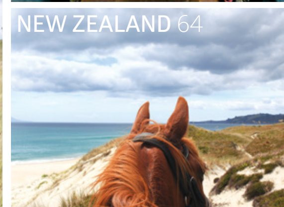
NEW ZEALAND 64